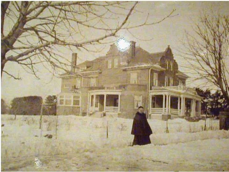
The house on a winter day in 1908.