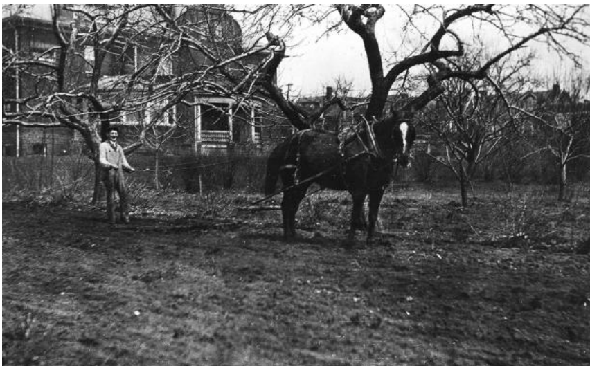
A field on what is now Riverdale Ave. is plowed before the First World War.