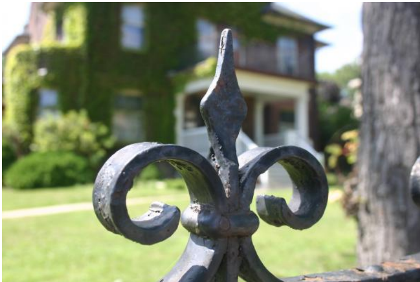
Built in 1901, the building at 450 Pape Ave. received heritage designation this week.