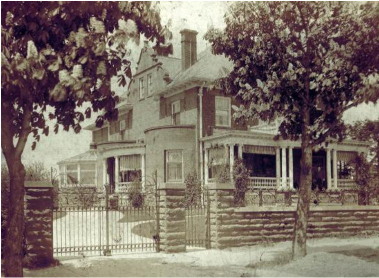
The house in 1902, a year after it was built at what is now 450 Pape Ave.