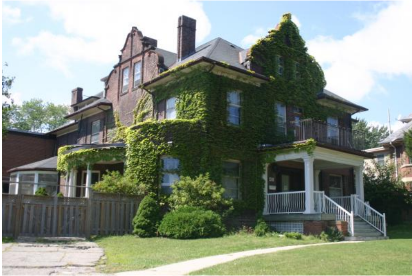
The city could put up $1.9 million to buy the former rooming house at 450 Pape Ave.